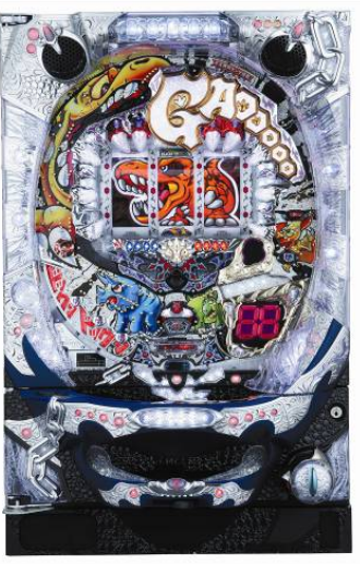
"Pachinko CR GAOGAOKING" Series (Sammy)