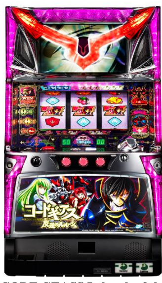
"Pachislot CODE GEASS Lelouch of the Rebellion" (Sammy)

@SUNRISE/PROJECT GEASS-MBS Character Design @2006 CLAMP @NAMCO BANDAI Games Inc. @Sammy