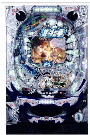
"Dejiten CR Hokuto No Ken Toki" (Sammy)

©Buronson&Tetsuo Hara/NSP1983 ©NSP2007 ,Approved No.YKN-10 ©Sammy