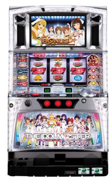
"Pachislot THE iDOLMASTER LIVE in SLOT!"

@SUNRISE/PROJECT GEASS-MBS Character Design @2006 CLAMP @NAMCO BANDAI Games Inc. @Sammy