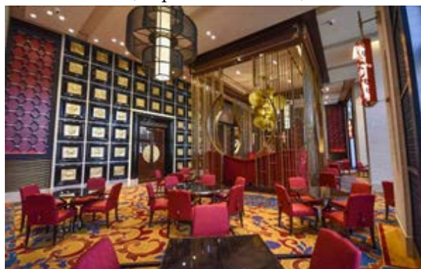
□ Restaurant (Imperial Treasure)