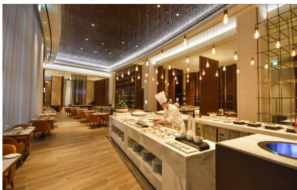
□ Restaurant (On The Plate)