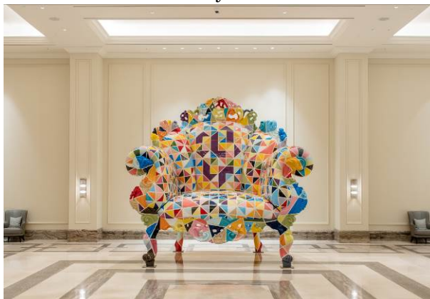
□ Artwork in the facility