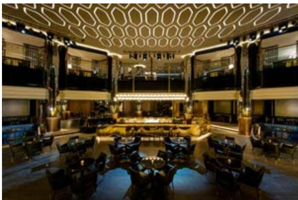
□ Entertainment hall (RUBIK)