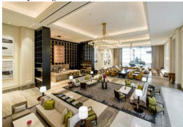
□ Lobby lounge