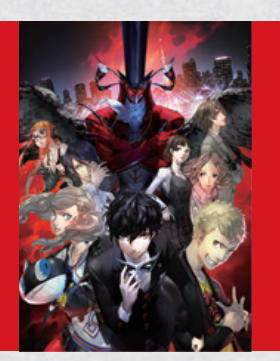
Persona 5 ©ATLUS. ©SEGA. All rights reserved.