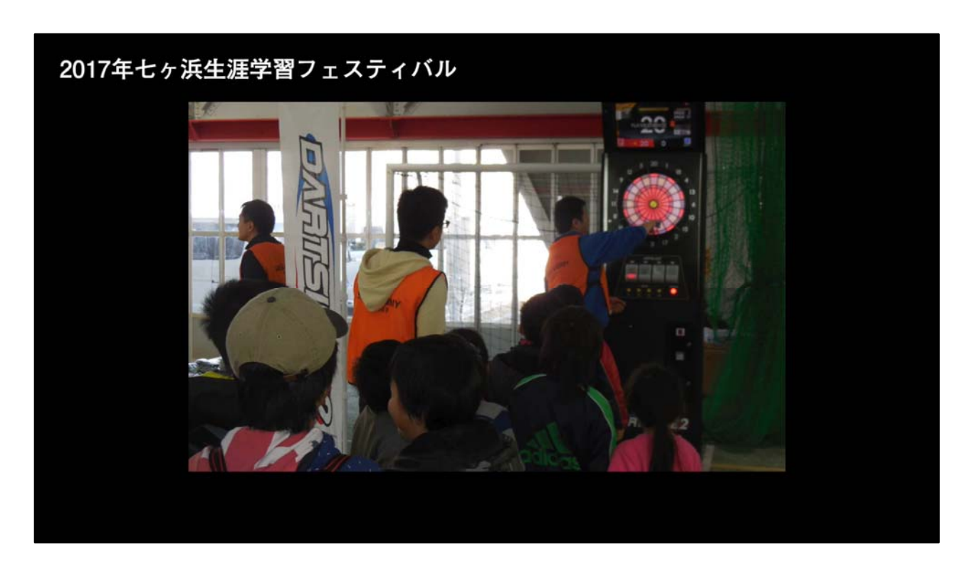
The 2017 Lifetime Learning Festival in Shichigahama-machi