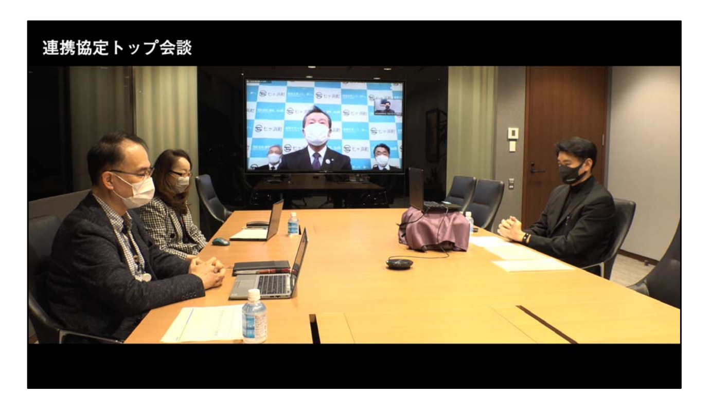
Top-level meeting about the Partnership Agreement