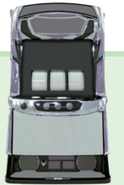
Smart pachislot Cabinet image

“Smart” pachislot and pachinko machines will start hitting the market in Japan in November 2022. The most distinctive feature of these machines is that there is no physical payout of medals or balls. This offers significant benefits for pachinko hall operators, users, and manufacturers.