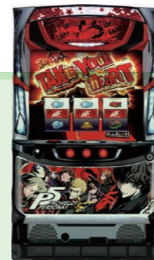
Pachislot Persona5 ©ATLUS. ©SEGA. All rights reserved. ©Sammy

Pachislot models in compliance with the No. 6.5 model, which comply with revised regulations, began reaching pachinko halls in June 2022. Some are already performing well, contributing to the revitalization of the pachislot market. Regulations for the new No. 6.5 models revised the upper limit on the number of games during the advantageous section and the method of managing the upper limit on medal pay-out. Data shows that, prior to the introduction of the new models, 70%–80% of pachislot players were dissatisfied with previous upper limits. The revisions sought to resolve this issue, and are thus expected to give further impetus to the market going forward. Taking advantage of the expanded scope of gameplay made possible by the revised regulations, the SEGA SAMMY Group will continue to pursue manufacturing based on user preferences, bringing to market a wide array of models offering compelling gameplay while complying with laws and regulations. We will help revitalize the pachislot and pachinko market by aiming to generate hit titles across a range of No. 6.5 models in pachislot, encouraging the return of dormant users and drawing in new users.