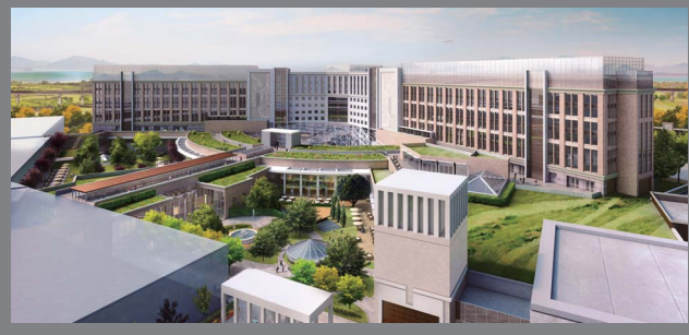
A rendering of the integrated resort that PARADISE SEGASAMMY is developing